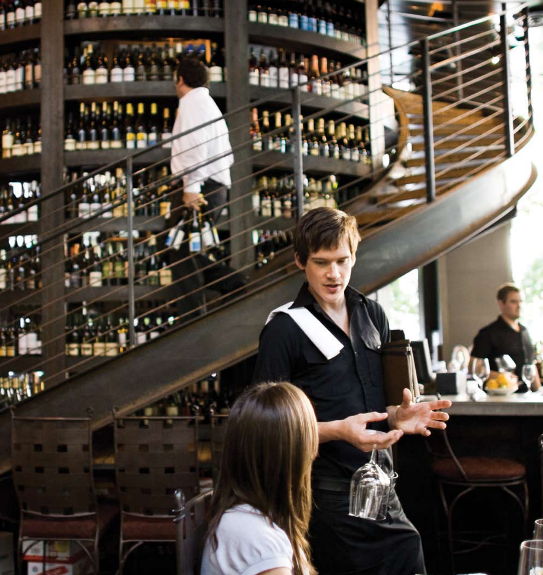
The Purple Café and Wine Bar (left), Ummelina International Day Spa, and Seattle Art Museum (above) all stand ready to nourish your body and your soul.

your choice. Despite the upscale food, the restaurant doesn't take itself too seriously. Afterward, stop by The Confectional in the market for a mini cheesecake, choosing Kahlúa white chocolate, Mexican chocolate, or one of the other dangerously decadent flavors.