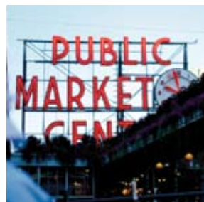
(top) Seattle Asian Art Museum; (above) the iconic sign at Pike Place Market; (right) the Space Needle looms large in a view from Capitol Hill.

Goodbyes are hard. Prolong yours from the observation deck of the city's odd 7 Space Needle . Here you can relive your three perfect days as you walk around the perimeter and look at the city below you. Rest your eyes on Elliott Bay, where just a little while before you were skimming across the water and planning your next trip to Seattle. /// Lisa K. Fann is HEMISPHERES' Seattle-based contributing editor.